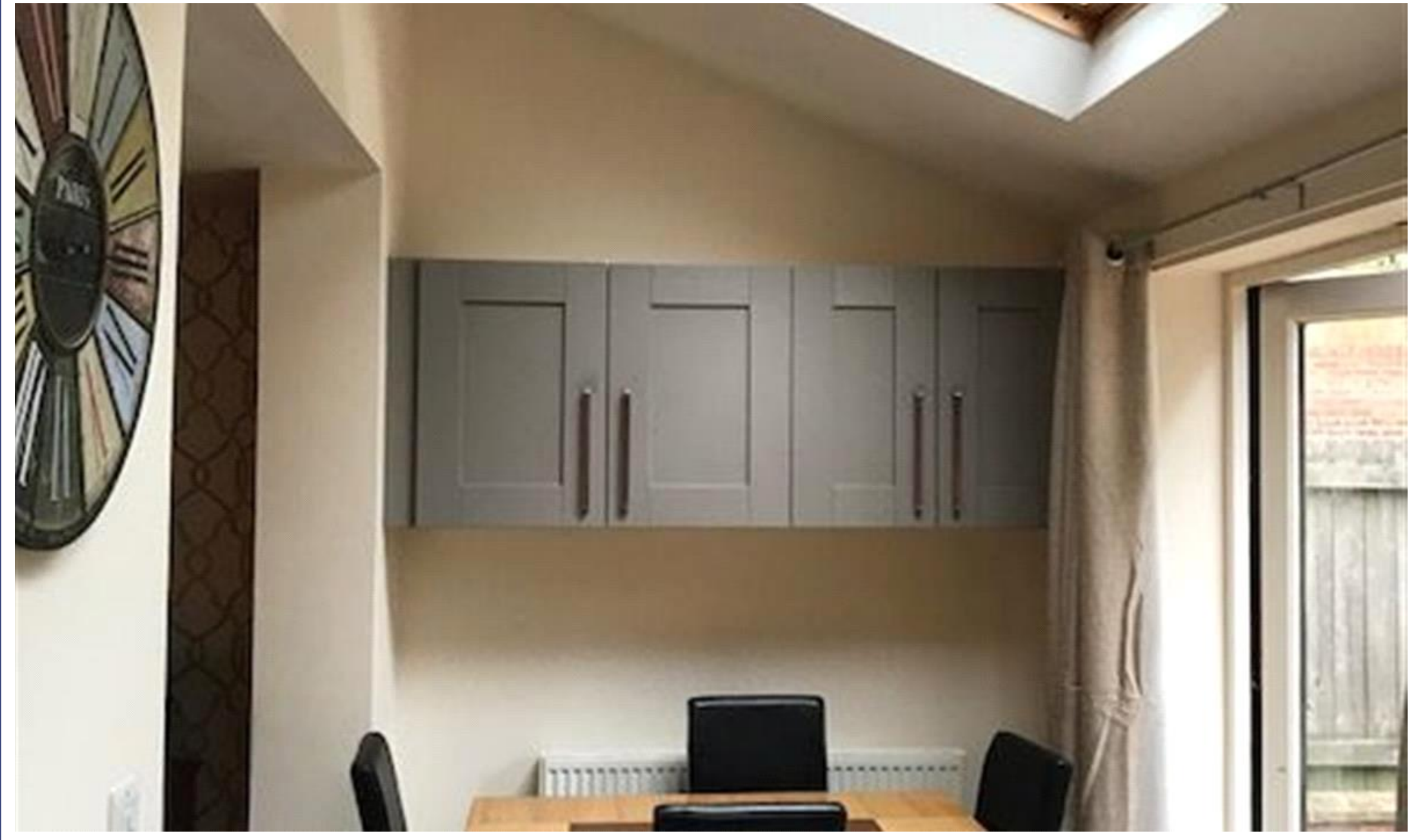
113 Allington Avenue, Nottingham NG7 1JY