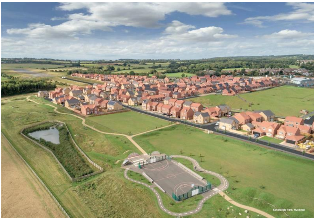
Sandlands Park, Hucknall